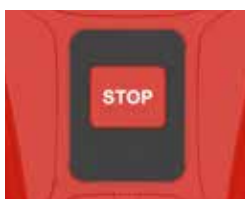
Display and Push Stop

Spiral cut In case of higher and/or thicker grass, the robot automatically activates the spiral movement to speed up the cutting area coverage.