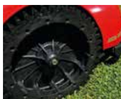
Self-cleaning toothed wheel