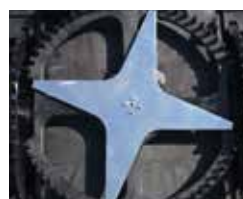
Blade and protection with filtering system for grass disposal